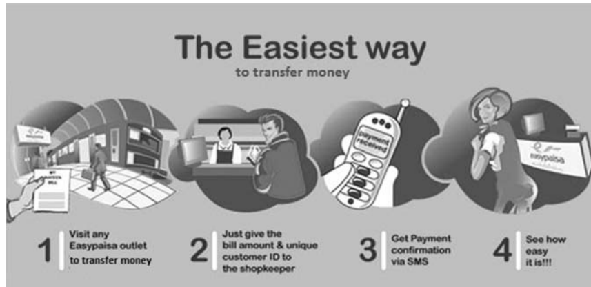
Figure 4 Money transfer by current process