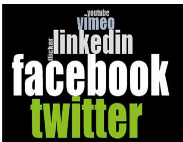
Fig 1: Word Cluster Diagram through NVivo by analysis of snapshots from websites of selected Universities

From the word cluster diagram, generated through NVivo, we can see that Facebook and Twitter are the most commonly used SM tools by the Pakistani HEIs. At the same time we do see usage of LinkedIn & Vimeo. Both are totally different from each other where LinkedIn is a professional social network platform and Vimeo allows institutes to upload their video mostly documentaries or short messages for promotion purposes. YouTube and flicker are also being used but by very few Universities. The YouTube is no longer active due to its ban in Pakistan and flicker has no updated content by the institutes which are using it.