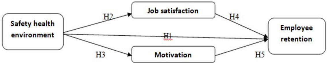
Figure 2 The research model showing regression weights obtained through Structural Equation Modeling (SEM)